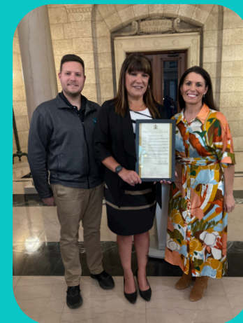
Recognizing Mental Health Week at the Manitoba Legislature